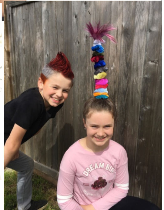
Annieville Has Heart!