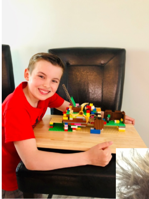
Wow! Look at that Lego Creation!